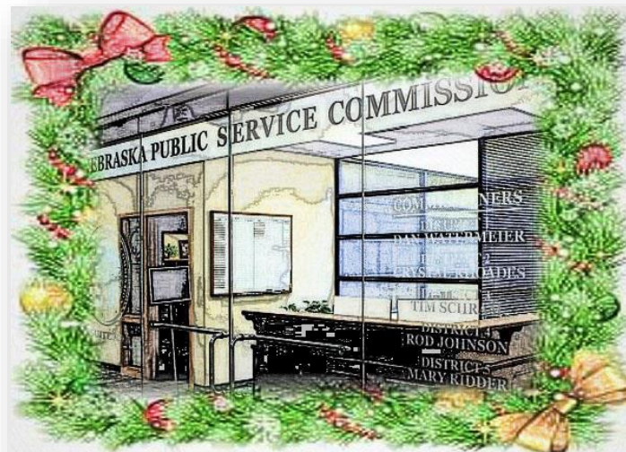
Happy Holidays from the PSC State 911 Department